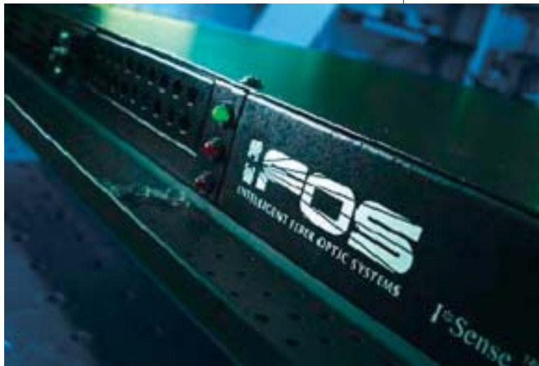
The I*Sense™ 14000 detects strain and stress values of smart structures, such as bridges, buildings, and dams.

IFOS continued to enhance the product design even further by adding multiple sensors on a single fiber. The I*Sense 14000 model makes parallel, high-bandwidth measurement of signals within an array of multiplexed optical sensors technically possible and economical. The technology has the capability to monitor optical systems that are up to several kilometers from the unit on a single 250-micrometer diameter optical fiber. Moreover, the system's data acquisition software and hardware permit the monitoring of four wavelengths per fiber module, and are expandable to accommodate